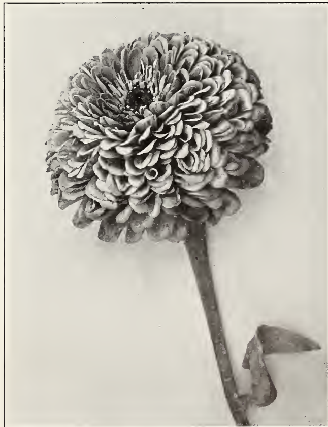
ZINNIA—DAHLIA FLOWERING GOLDEN STATE